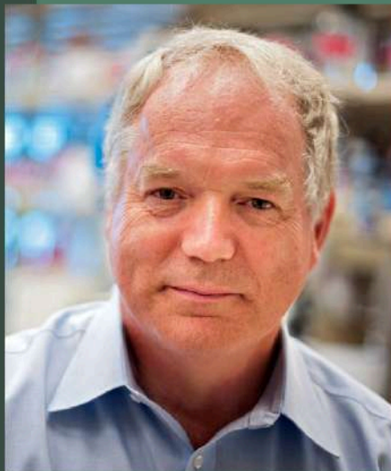
Nobel Prize Laureate Dr. Michael Houghton

Introduction to Discovery Learning Discovery Learning 1 Discovery Learning 2 Objective Structured Clinical Examination (OSCE) Simulation Residents: Life and Service